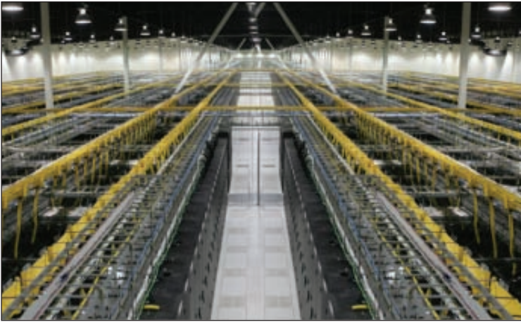
Mission operates its SCADA service from a carrier grade computer co-location center located near Atlanta, Georgia.

Mission combines Software as a Service (SaaS) with purpose-built hardware to provide a highly reliable and cost effective “turn key” system. The SaaS business model allows you to get more features with less effort at a substantially lower cost than can be achieved in-house. This business model is ideal for applications that are repeatable, like collection system monitoring and smaller water systems. According to CIO Magazine, utilities are the third largest users of SaaS behind Technology and Financial Service providers 3 .